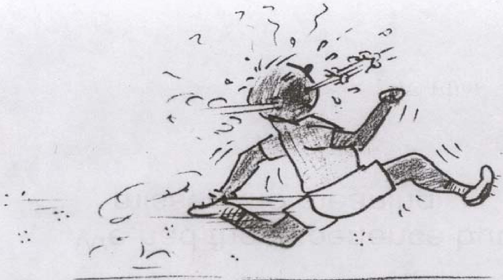
Running a temperature